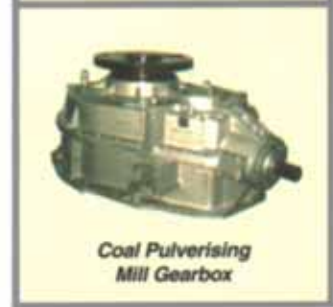
Coal Pulverising Mill Gearbox