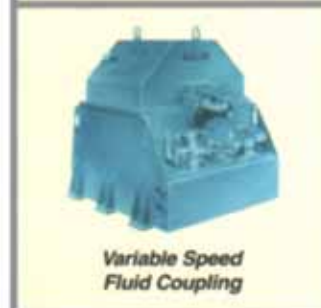
Variable Speed Fluid Coupling