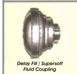
Delay Fill / Supersoft Fluid Coupling