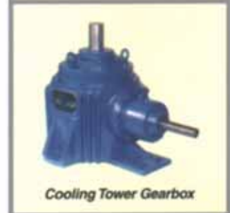
Cooling Tower Gearbox